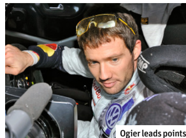
Ogier leads points