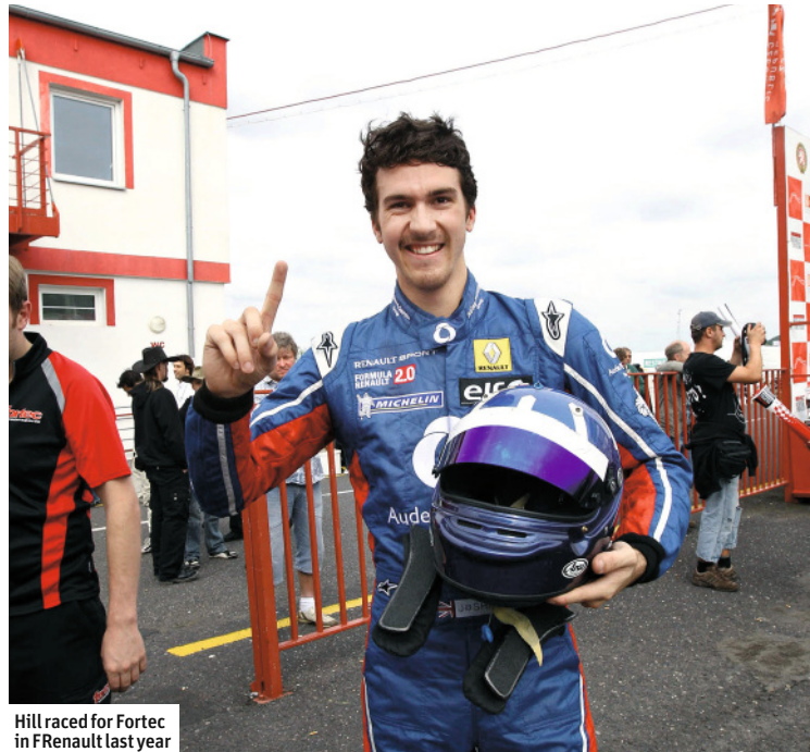
Hill raced for Fortec in FRenault last year

Both Hill and Caterham-backed Suranovich – who contested the Brasil F3