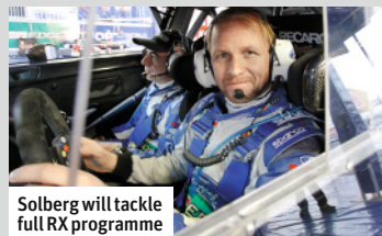
Solberg will tackle full RX programme

Petter Solberg will complete a full European Rallycross campaign in a Citroen DS3 built and run by his own team. Solberg is one of 15 drivers to have signed centralised contracts with the series, which was launched at Lydden last week.