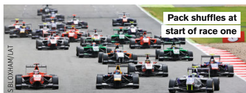
Pack shuffles at start of race one

In race one: 25-18-15-12-10-8-6-4-2-1 to top 10 finishers. In race two: 15-12-10-8-6-4-2-1 to top eight finishers. Two points for fastest lap among top-10 finishers in each race.